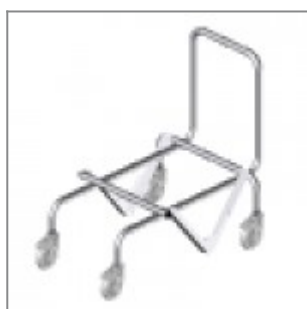
Black painted chair trolley for skid chairs