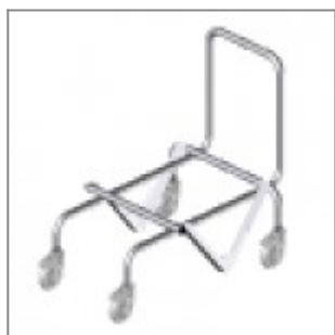
Black painted chair trolley for skid chairs