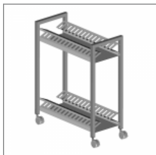
Black painted trolley for writing tablet