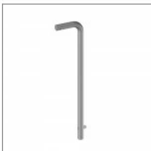
Chrome metal left hand support for Ø14 allu.mechanism