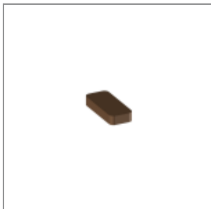
Single felt dim10x24x4