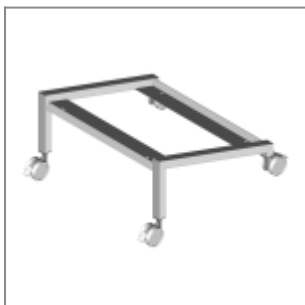
Ca + ec + mk + Li chair trolley