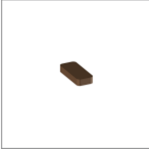
Single felt dim10x24x4