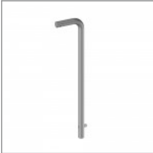
Chrome metal left hand support for Ø14 allu.mechanism