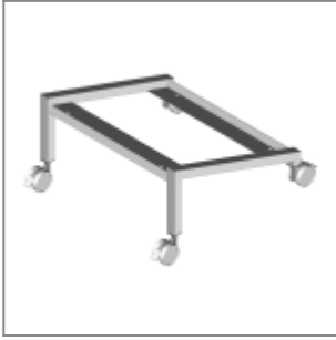
Ca + ec + mk + Li chair trolley