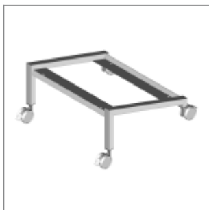
Ca + ec + mk + Li chair trolley