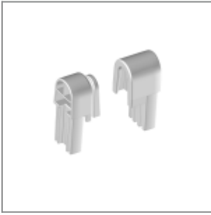
Make Up male+female black linking device