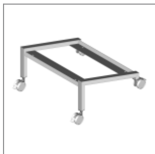
Ca + ec + mk chair trolley