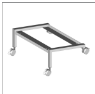
Ca + ec + mk + Li chair trolley