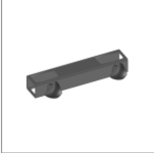
Front linking device Make Up without arm