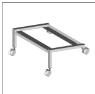
Ca + ec + mk + Li chair trolley