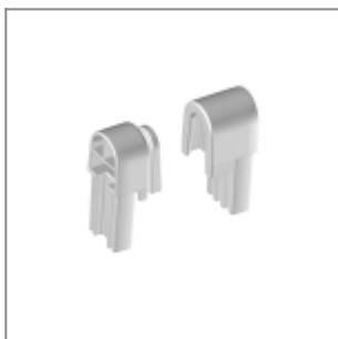
Make Up male+female black linking device