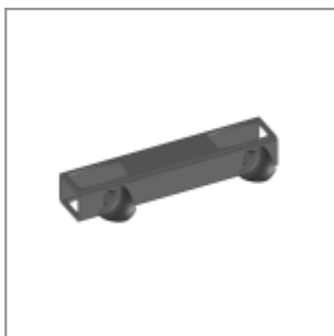
Front linking device Make Up without arm