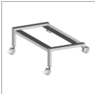
Ca + ec + mk + Li chair trolley